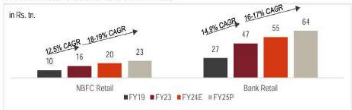
Note: P = Projected; Retail credit above includes housing finance, vehicle finance, microfinance, gold loans, construction equipment finance, consumer durable finance, MSME loans and education loans; Source: Company reports, RBI, CRISIL MI&A