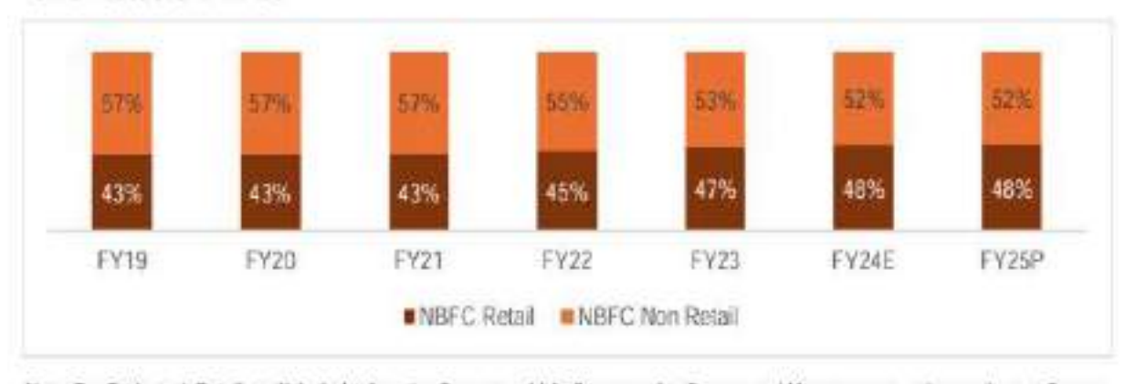
Note: P = Projected: Retail credit includes housing linance, vehicle finance, microfinance, gold loans, construction equipment finance, consumer durable finance, MSME loans and education loans; Source: Company reports, CRISIL MI&A